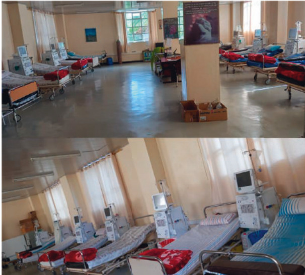
FIGURE 4: A picture of Ayder Hospital's haemodialysis centre displaying empty beds and having no patients connected to the haemodialysis machine due to lack of haemodialysis consumables.

have been saved under normal circumstances have died due to lack of available haemodialysis supplies and central venous catheters.